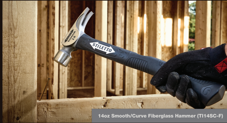
14oz Smooth/Curve Fiberglass Hammer (TI14SC-F)