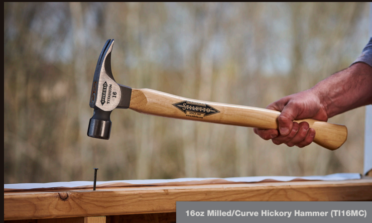
16oz Milled/Curve Hickory Hammer (TI16MC)