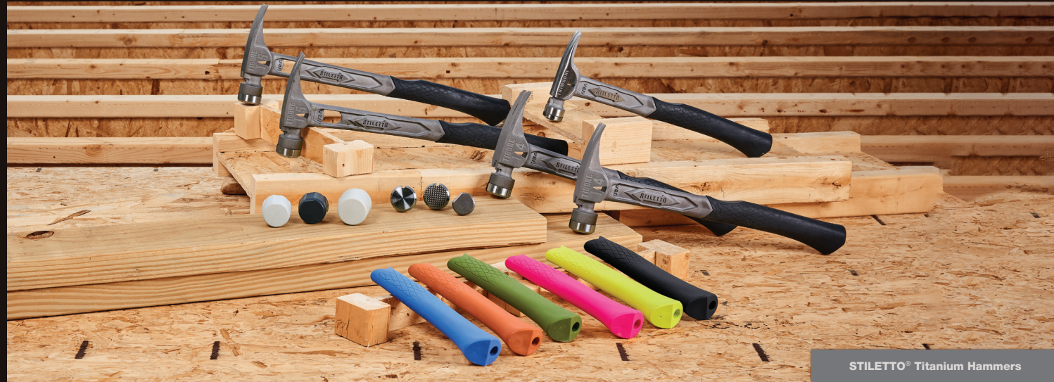
STILETTO® Titanium Hammers