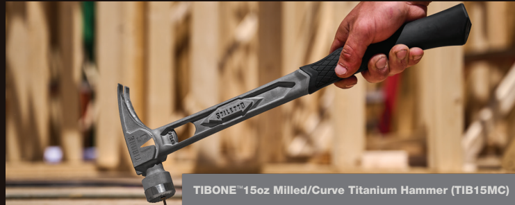
TIBONE™ 15oz Milled/Curve Titanium Hammer (TIB15MC)